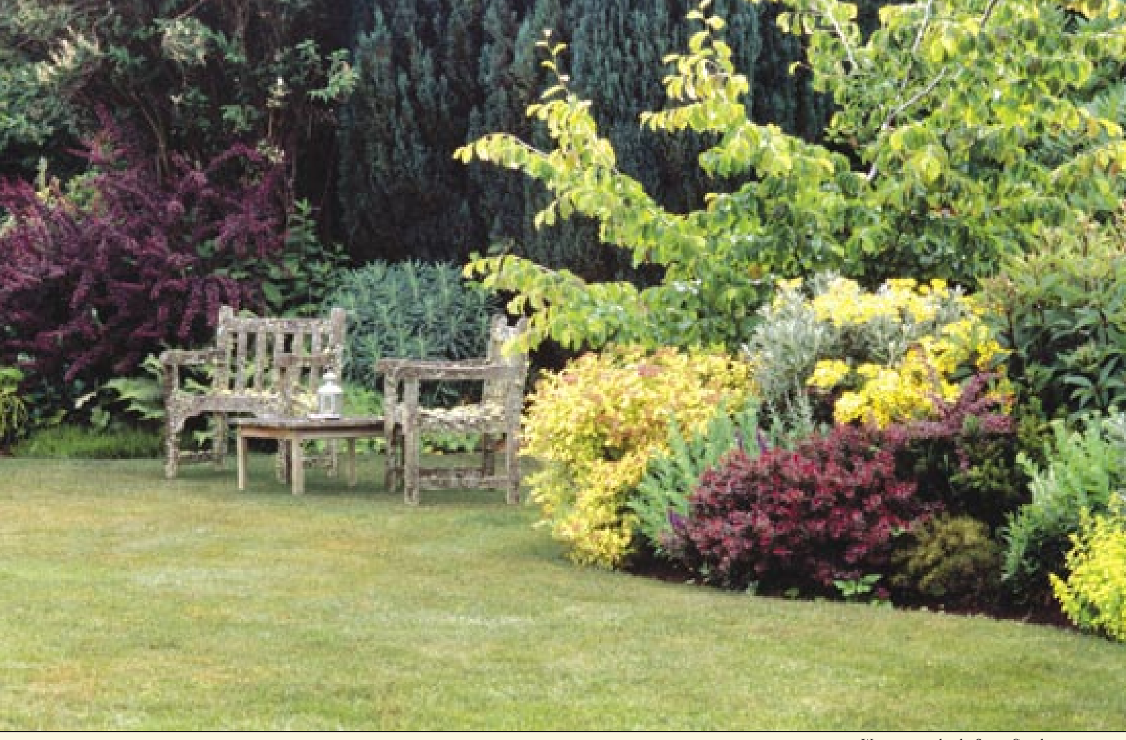
Waterwise garden by Stacie Crooks