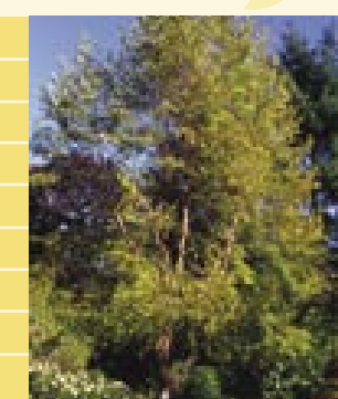
Betula alboseninsis var. septentrionalis